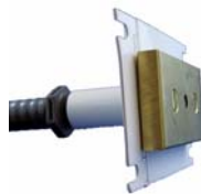
FI FIELD INTERCONNECT